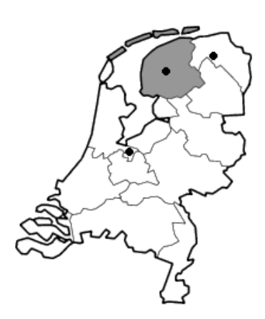
Figure 1. The shaded province in the north of the Netherlands is Fryslân. The dot in the middle of the country is Bussum. The dot in the province to the right of Fryslân is Groningen, where the first pilot took place. The second pilot was conducted in Reduzum, dot in the middle of Fryslân, the shaded province. In Nigtevecht, which is close to Bussum, the dot in the middle of the country, the last pilot was held.

to Frisian and the Frisian language. We chose participants from a school for practical reasons, because in a class setting instruction can be given in an efficient way.